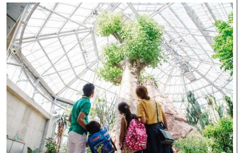
Tokiwa Plant Museum