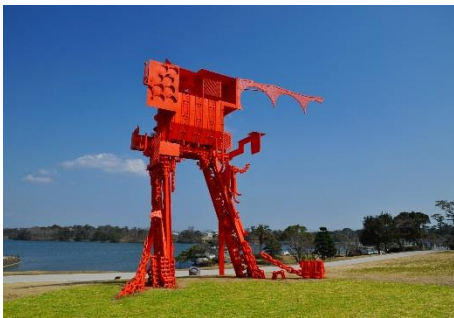
UBE Biennale Sculpture Hill

Average Temperature: 16.1°C (statistics from 2002-2010)