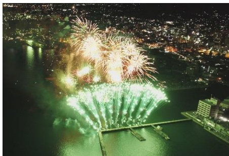
Ube City Fireworks Festival