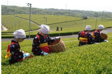
Fujigochi Tea Plantation